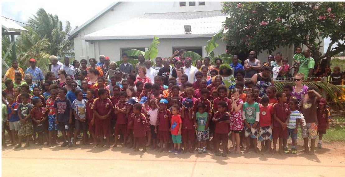
Figure 1: Bp Tolowa and parishioners of Holy Trinity Church

The Personal Ordinariate of Our Lady of the Southern Cross